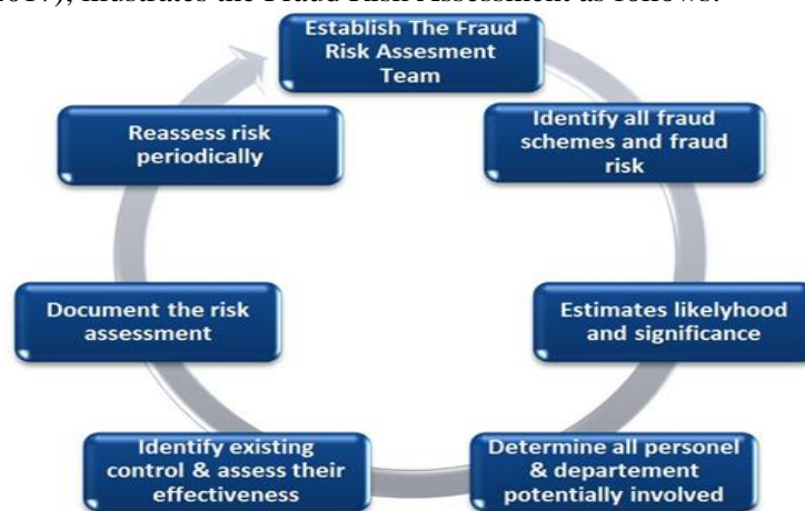
Figure 1 Fraud Risk Assessment Process

This definition provides an understanding that the process of assessing a fraud risk is dynamic and repetitive. In addition, adjustments can be made according to the complexity and objectives of the organization. In conducting a risk assessment, one should consider the scheme/fraud scenarios that might occur in the organization to obtain an appropriate anti fraud guideline for the organization. As stated by COSO in Alfurqan (2017), illustrates the Fraud Risk Assessment as follows: